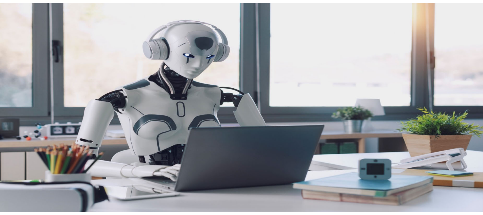
About EVMPAI™ Earned Value Management Professional Artificial Intelligence™ Certification

The EVMPAI<sup>TM</sup> Earned Value Management Professional Artificial Intelligence<sup>TM</sup> leads, directs, manages, executes, and controls Artificial Intelligence (AI) projects and programs on time, within technical scope, within budget, and of top quality.